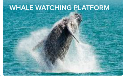
WHALE WATCHING PLATFORM