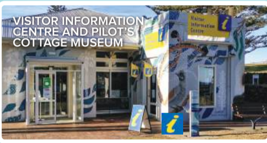
VISITOR INFORMATION CENTRE AND PILOT'S COTTAGE MUSEUM