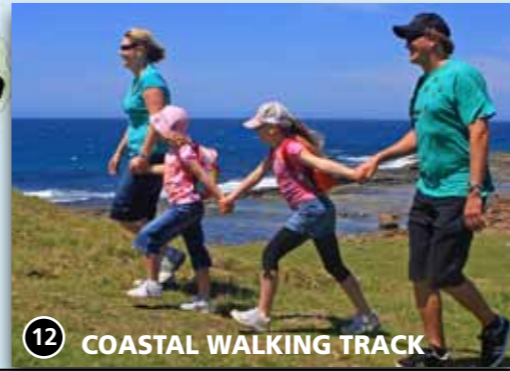
12 COASTAL WALKING TRACK